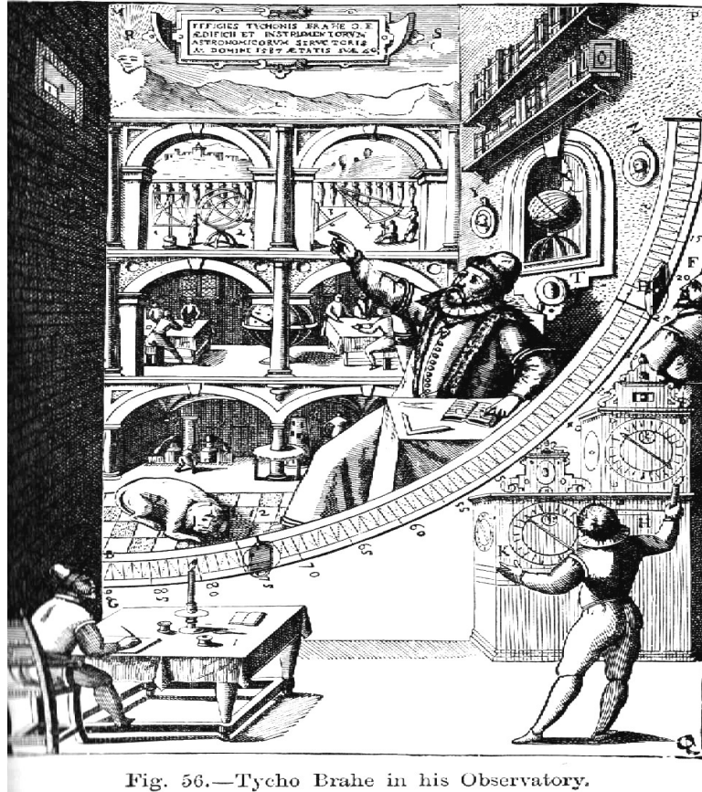
Fig. 56.—Tycho Brahe in his Observatory.